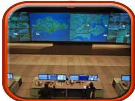
ITS CENTRE Intelligent Transport Systems Centre